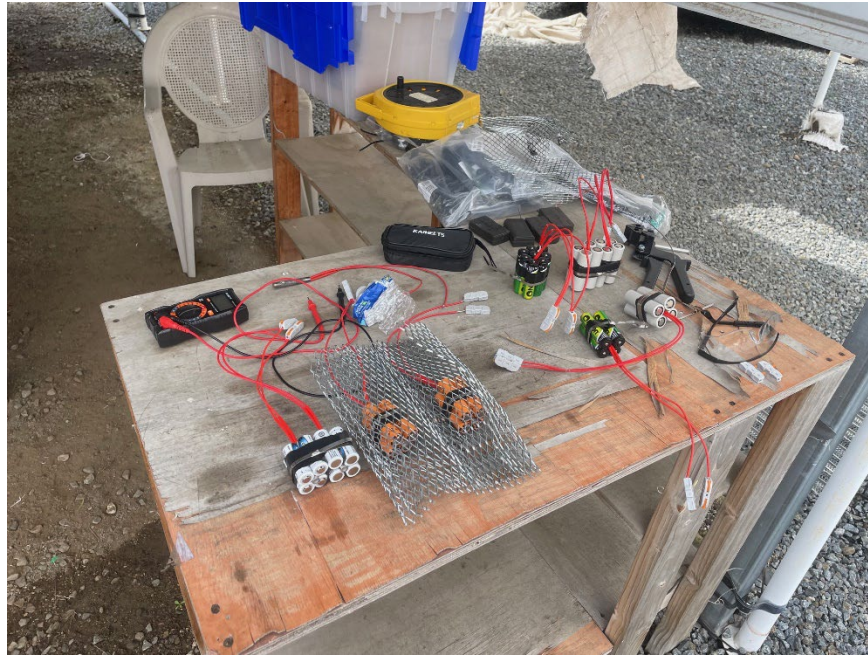
Photograph C: Thermocouple heating elements being attached to various LIB configurations and tested for voltage/SOC prior to inducing thermal runaway. Mesh wire was sometimes used to mitigate the risk of projectiles during experimentation.