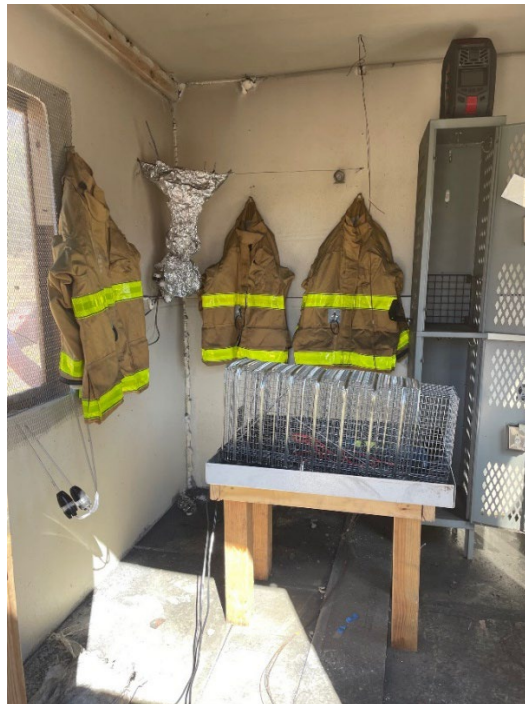
Photograph D: Inside experiment shed. Note the locker used to house equipment (inside or on top) and the raised tray to place test subjects on, this time with a mesh cage to prevent projectiles. Several firefighter “turnout” jackets were placed inside during experiments to be analyzed by a partner entity. EPA sampling and monitoring media is in the corner shielded by a tin foil barrier to prevent heat from melting tubing. Various vendor equipment can be seen throughout.

Sampling procedures were carried out for Runs 3, 7, 9, 11, 12, and 13. A duplicate sample was executed on Run 9 for HF (NIOSH 7902), Run 11 for metals (NIOSH 7303), Run 12 for HCN (NIOSH 6010), and Run 13 for ASTM-D-1945. All samples were taken using the laboratory provided Tygon tubing, which was plumbed through the shed flap vent where sample media was suspended at approximate breathing zone height (5 feet to 6 feet). See Photograph D and Photograph E .