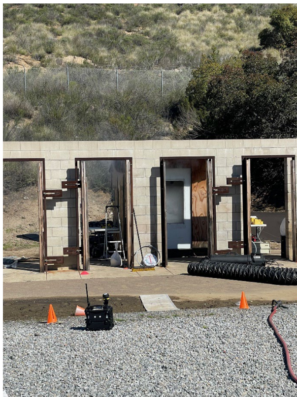
Photograph F: Note the heavy amount of off-gassing matter through the shed door window and the off-gassing on the left side of the shed walls. An AreaRAE monitor provided by SDFD monitors for gaseous migration at the perimeter of the Hot Zone.

concentrations rely on varying sample volumes collected throughout each run. Analogously, air monitoring values reflect their continuous, real-time data sets. Photograph F provides a look at the shed door window during an experimental thermal runaway off-gassing event (Run 10).