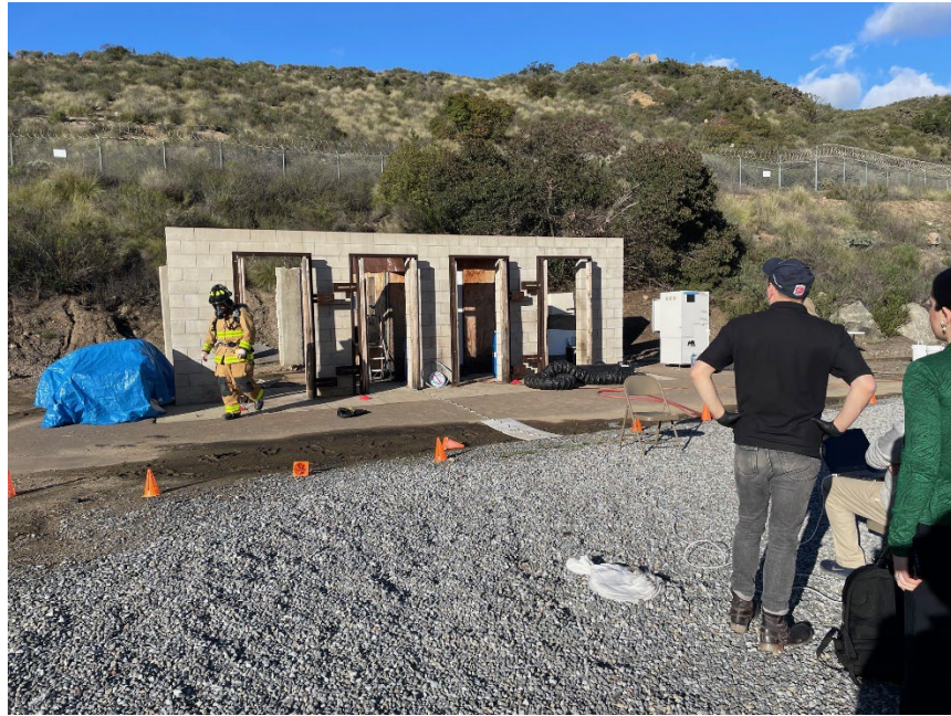
Photograph A: Experimental shed and existing block wall barrier from outside of the Hot Zone. All personnel inside the Hot Zone were required to don Level C or higher personal protective equipment (PPE) during experimental activity.