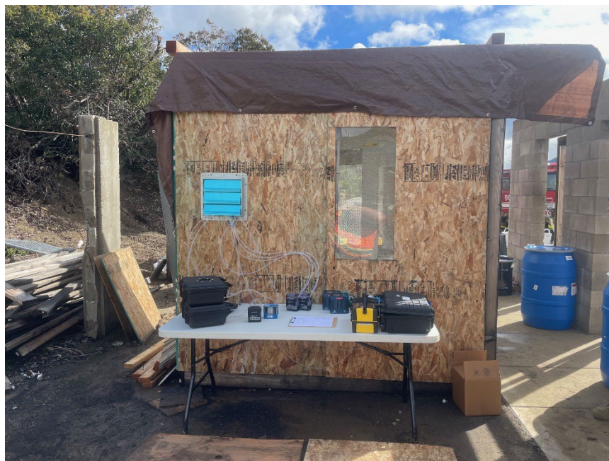
Photograph B: Side view of experimental shed showing plywood construction with a plexiglass window, a flap vent, and all EPA monitoring and sampling equipment being plumbed through the wall vent.