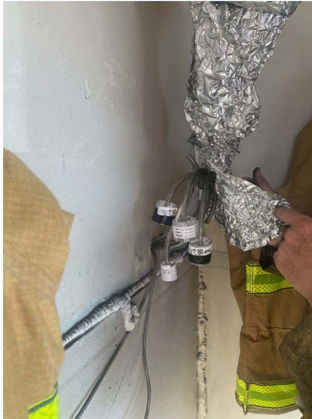
Photograph E: A peak behind the tin foil shield shows EPA sampling and monitoring media at approximate breathing zone height plumbed through the shed wall. Each set of tubing and sample media is labeled to ensure accuracy.