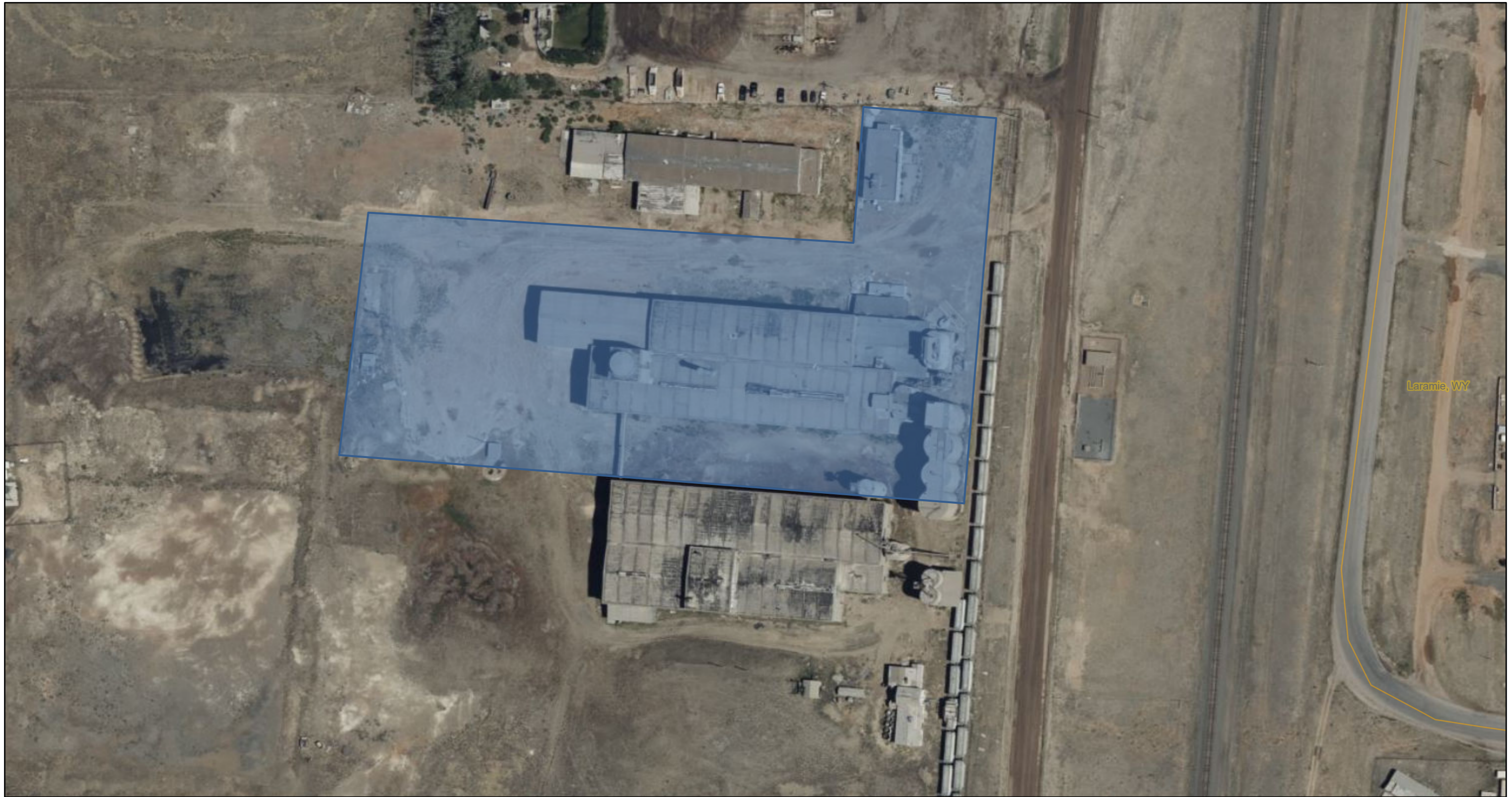
Figure 1 - Approximate Site Area Nedlog Arsenic B-1 Removal